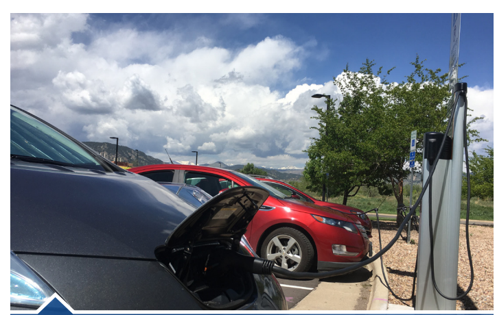
More fast charging stations are needed to encourage widespread adoption of electric vehicles.

Promote other clean modes of transportation like EV carsharing, electric buses and walking, biking and transit in order to encourage clean travel without requiring EV ownership.